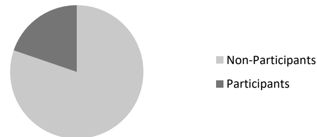
2024-25 Student-Athlete Participation (Female)

*Numbers based on total number of players on a team roster on the official first day of competition