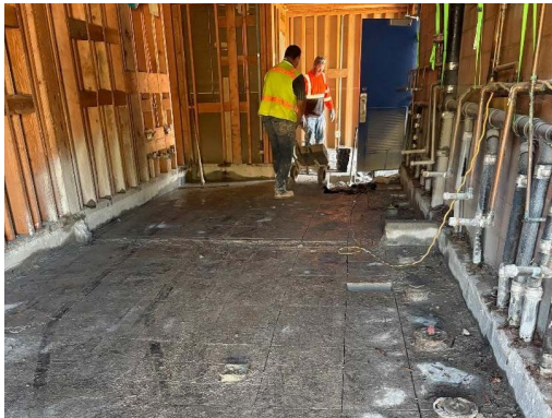
Restroom Demo of Finishes

Work completed during summer of 2025 on Site Painting, Roofing and Doors & Hardware campuswide. Work recently completed on main Elementary Restroom facilities that added New Fire Alarm Devices, Alarm devices and full ADA compliance to the space. All finishes have been replaced with impervious materials and are bright and clean.