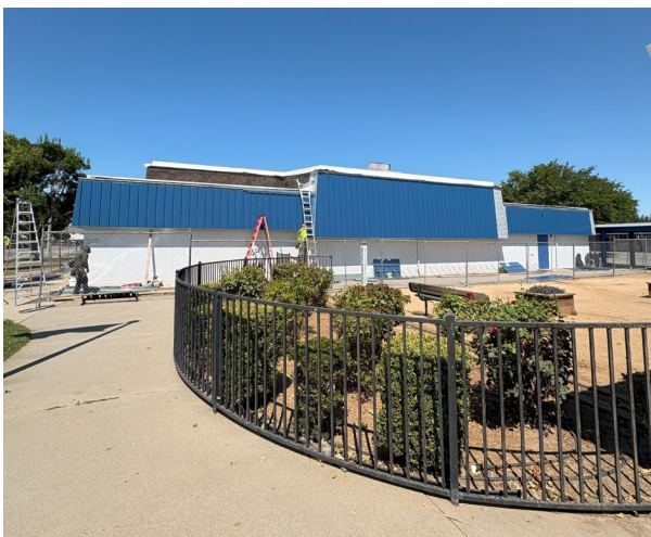
View of MPR Exterior Roof & Paint