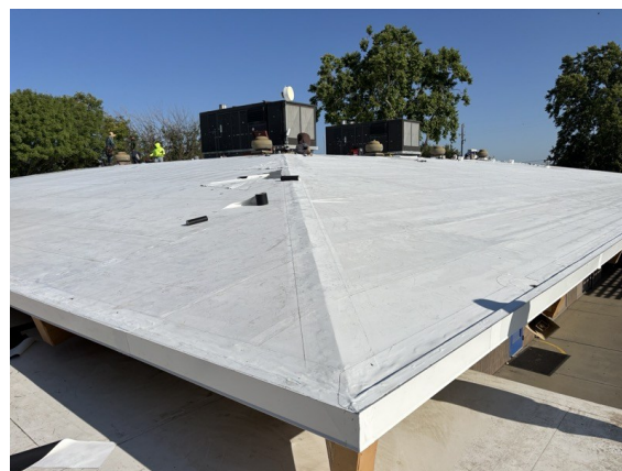
View of New Roof at Library Bldg.