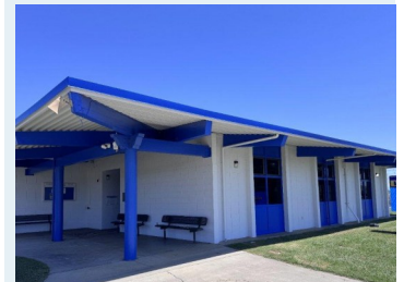
Updated Exterior Maxwell Elementary