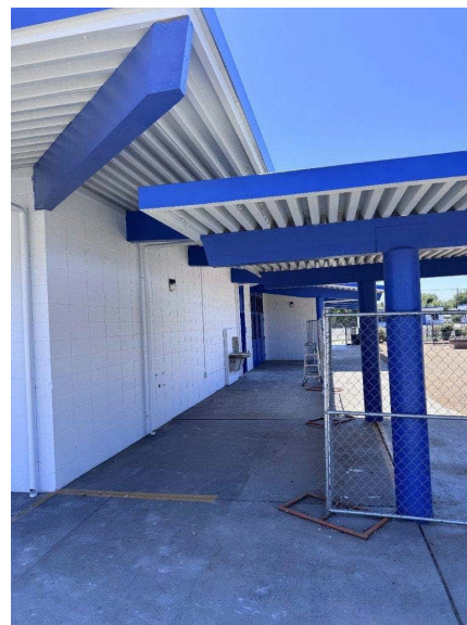
View of Admin Bldg. Exterior Paint