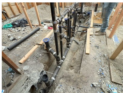
View of New UG Plumbing

Work has been completed on various roofs for Library, Welding & District Office Bldgs., new door locks and hardware, exterior painting and stucco repairs during the summer of 2025. Work is just finishing on the main HS restroom spaces that adds new Fire Alarm devices and full ADA compliance to the space. All finishes have been replaced with impervious materials and are bight and clean.