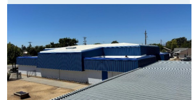
Updated Exterior Maxwell ES/MPR