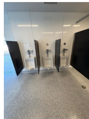
New Restroom Finishes