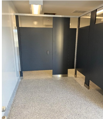
New Restroom Finishes