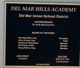
Project: Del Mar Hill Academy - Modernization Company: DEL MAR UNION SCHOOL DISTRICT Taken: Aug 19, 2025 at 9:52 AM