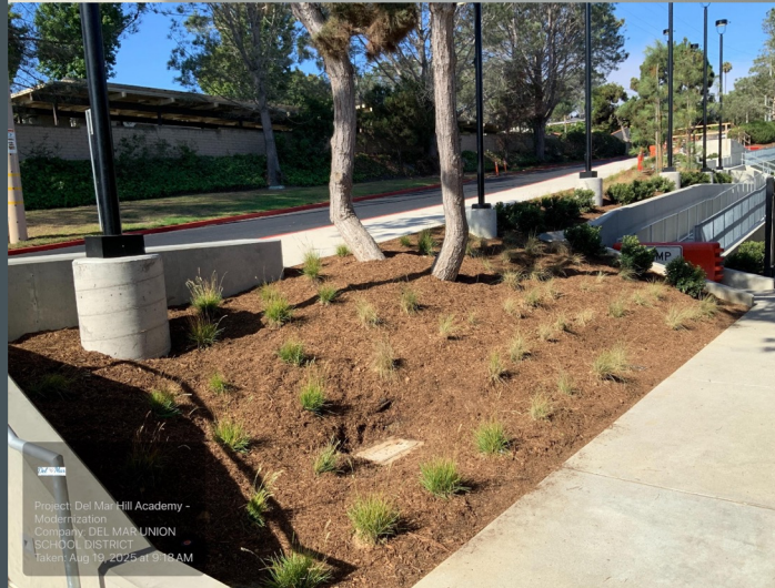
Project: Del Mar Hill Academy - Modernization Company: DEL MAR UNION SCHOOL DISTRICT Taken: Aug 19, 2025 at 9:18 AM