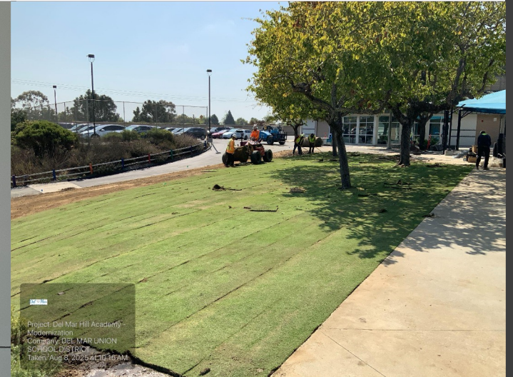
Project: Del Mar Hill Academy - Modernization Company: DEL MAR UNION SCHOOL DISTRICT Taken: Aug 8, 2025 at 10:16 AM