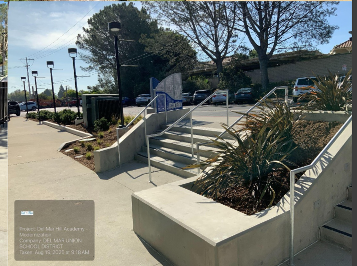
Project: Del Mar Hill Academy - Modernization Company: DEL MAR UNION SCHOOL DISTRICT Taken: Aug 19, 2025 at 9:18 AM