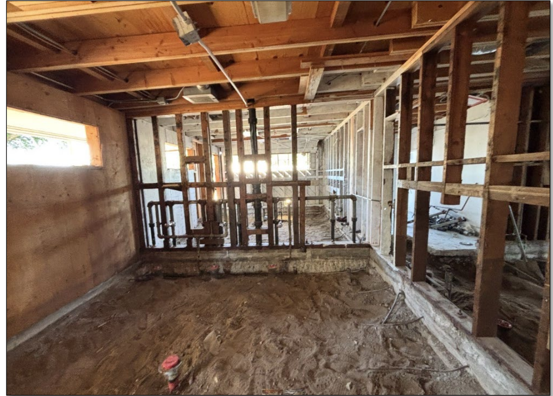
Del Paso ES (In Progress)