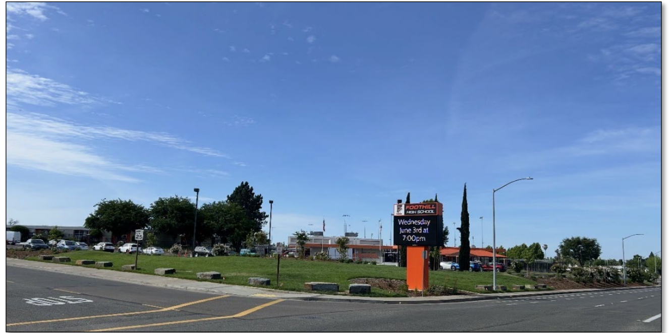
Foothill HS Marquee Landscape