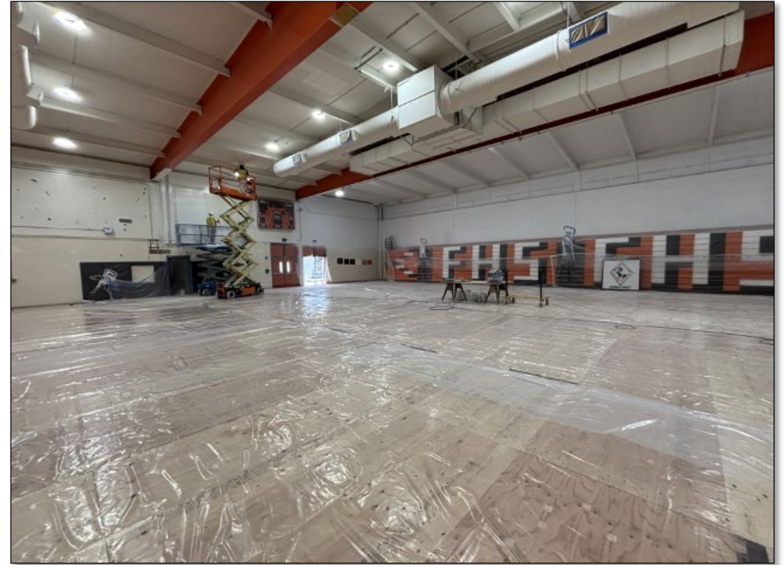
Foothill HS Gym (in progress)