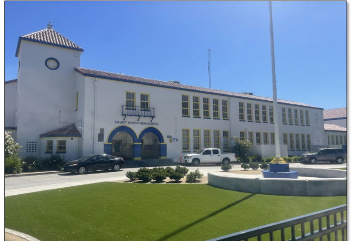
Grant HS Exterior Paint (Before)