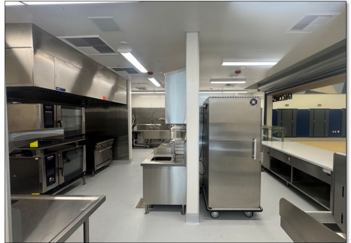
Garden Valley ES Kitchen (In Progress)