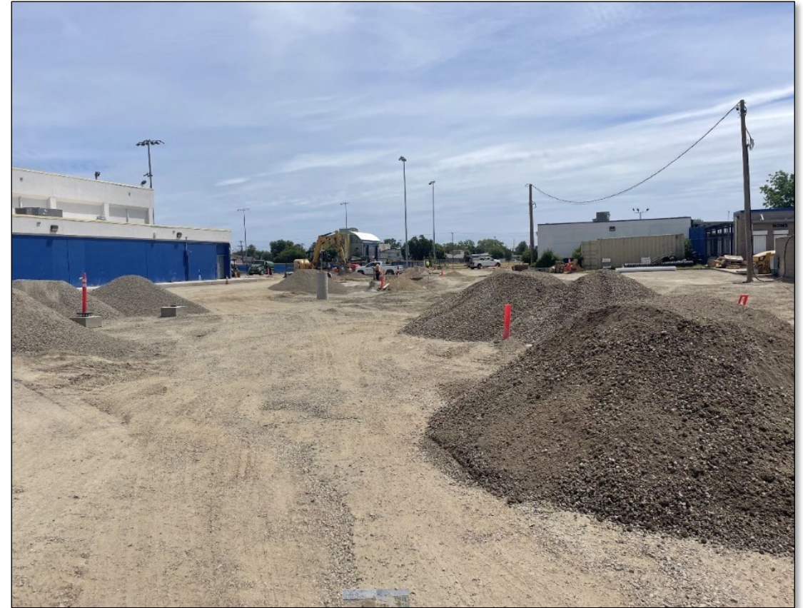
Grant High School Hardcourts Phase 2 (In Progress)