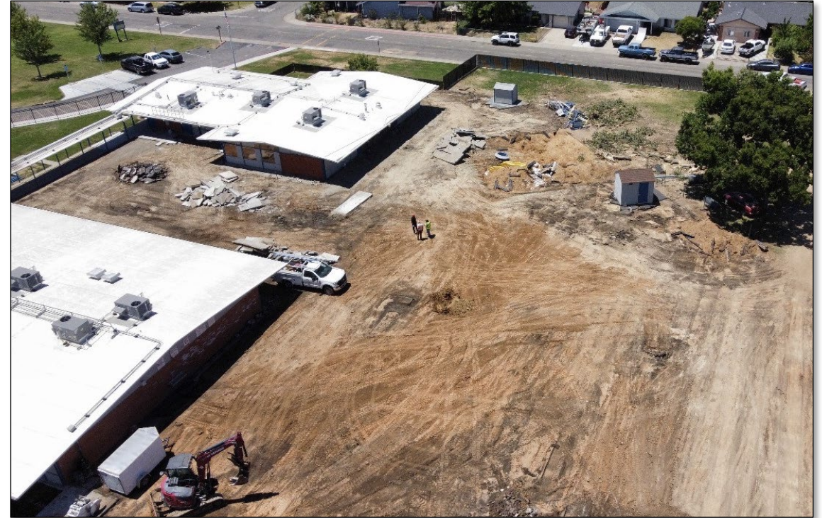
Sierra View ES (In Progress)