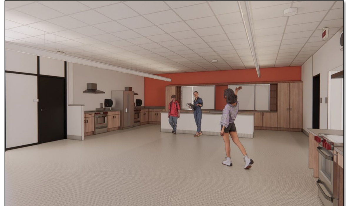
Foothill HS Culinary Classroom Modernization (Concept)