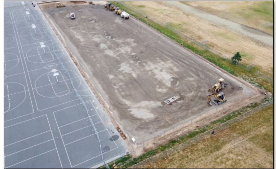
Martin L. King, Jr. Tech Academy (in progress)