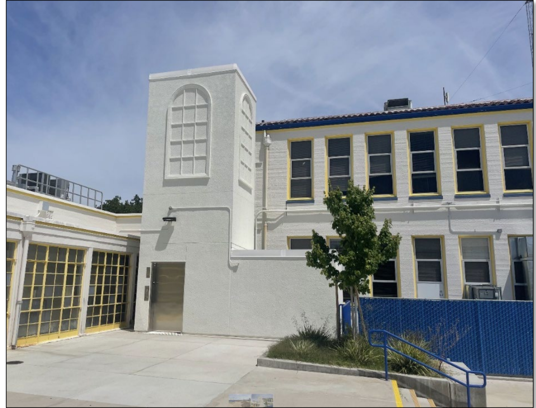
Grant High School Elevator Addition