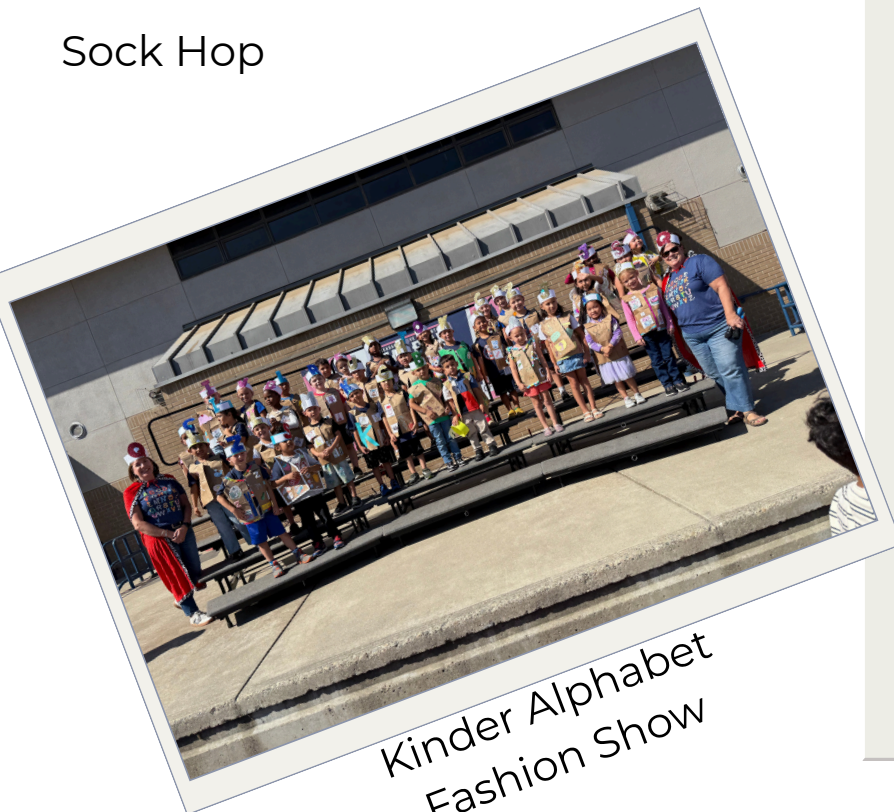
Kinder Alphabet Fashion Show