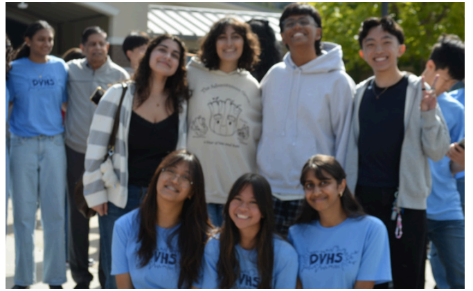
Students enjoying a fun game at the Choir camp